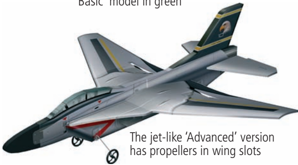
The jet-like 'Advanced' version has propellers in wing slots