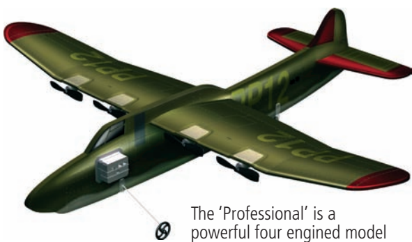
The 'Professional' is a powerful four engine model