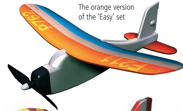
The orange version of the 'Easy' set

Question: How many X-Twin models can be flown at the same time?