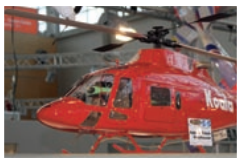
Jamara again, this time it's a larger scale canopy in the shape of a lovely looking Koala