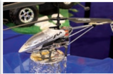
The good news from Jamara is that Flying Toys will now be distributing their range of sub-micro helis in the UK