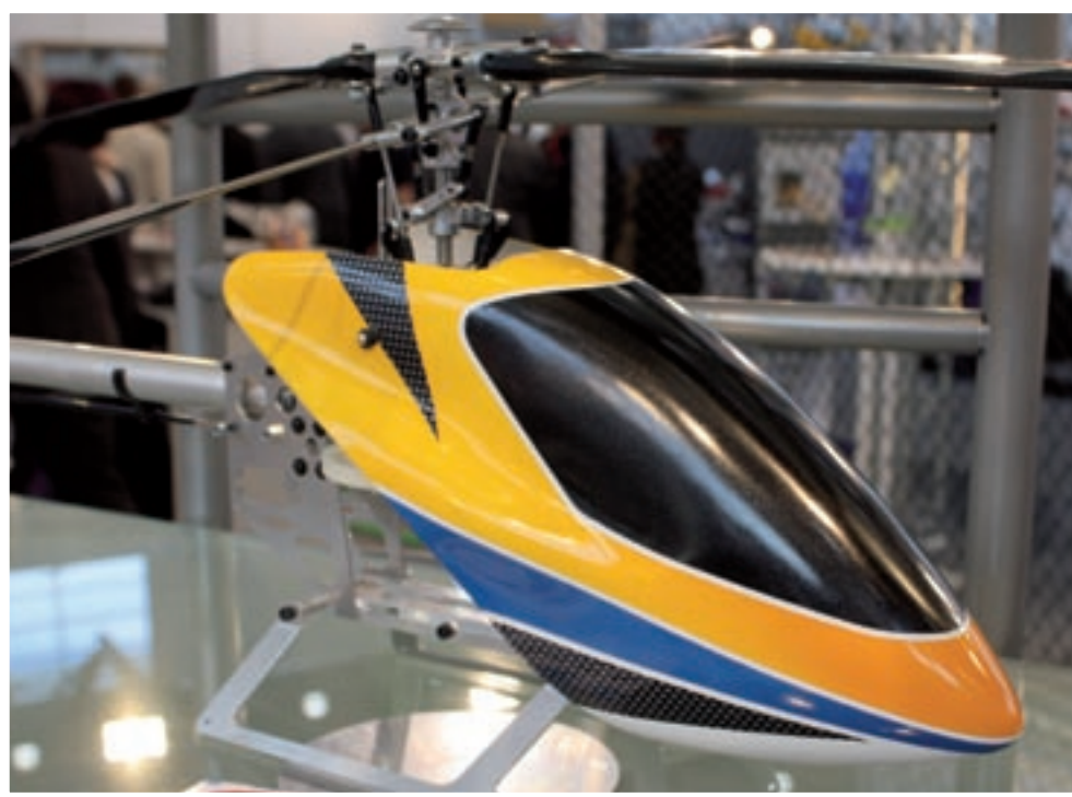
This Shark 600 electric model from Jamara is made from 95% aluminium