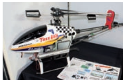
An ingenious pilot assisting system that uses a PC and GPS to help fly a model was shown by Hobby Alliance