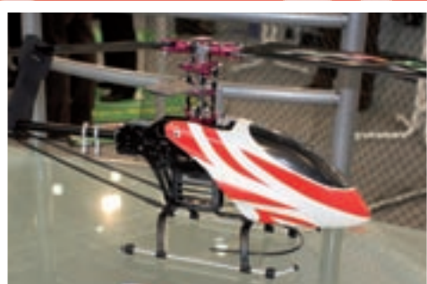
This is the TNT 3D Pro from Jamara which is fitted with plenty of anodised alloy hop-up parts