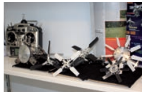
Hobby Alliance also had a range of multi-bladed heads on display which are ideal for scale projects