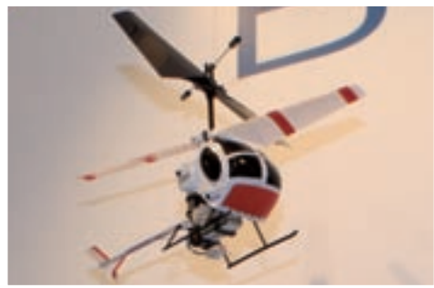
The newest addition to the E-flite range of helis is this scale mCX that was seen on the Horizon Hobby stand