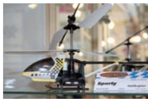
Jamara products being distributed by Flying Toys in the UK include this good looking little contra model