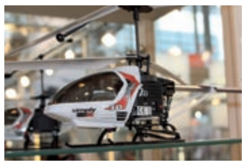
Jamara always have a good range of helicopters on their stand and this year was no exception