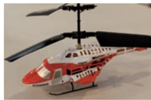
Another Jamara model is this more scale looking sub-micro that's sure to be a popular choice