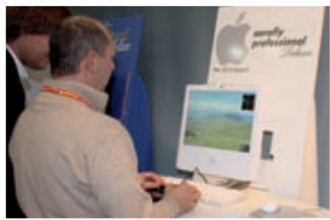
The Aerofly Professional flight sim will soon be available from Ikarus to run on an Apple Mac natively under OS X