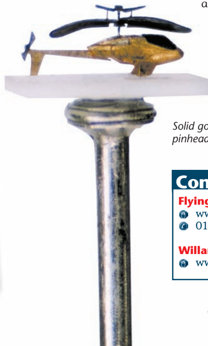
Solid gold carved Picoo-Z on a pinhead by artist Willard Wigan

The website additionally offers an opportunity to literally turn the pages on their colourful 72 page on-line catalogue for immediate reference, and to order an A4 glossy copy! RCMW