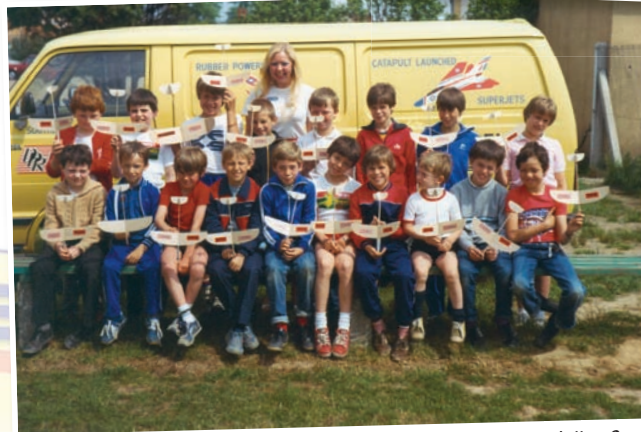
Kids competition at Filey 1983. How many are still modellers?